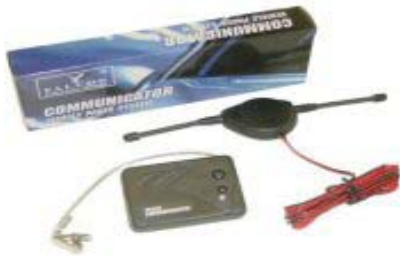
Falcon Communicator & Pager

Email info@nebula-pps.co.uk http://www.nebula-pps.co.uk