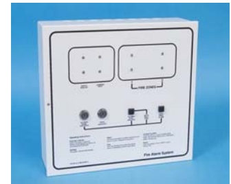
2 Zone Economy Fire Panel

Walk Test, Latching Fault Condition, Short Circuit to Fire and Zone Isolate.