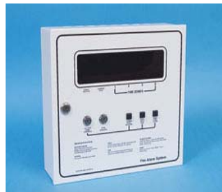
Nebula 4 Zone Fire Alarm Panel

On July 2006, new EU regulations have come into force regarding the use of lead and other dangerous chemicals in electronic equipment. Nebula has worked hard to ensure that all of our products comply with these regulations and will soon be offering a re-cycling service for all of our products as laid down in the WEEE directive.