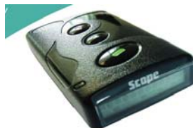
GE-03 Vibrating Pager

High Quality Long Range System Fire Alarm Software