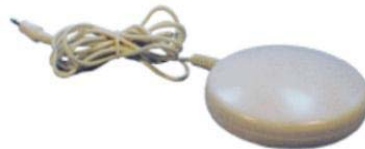
Vibrating Pillow Pad

Guest Houses and Hotels find our radio controlled vibrating pillow alarm system very easy to use as it can be moved from room to room as required.