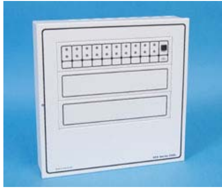
30 Way Call Panel (With 10 Zones Fitted).

A three wire connection is used for each zone and the panels can support an extensive range of call units from bedside Call tails, Toilet alarms to Radio linked Panic Alarms.